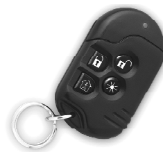
Figure 1. MCT-234

Each transmitter is supplied with a small key ring.